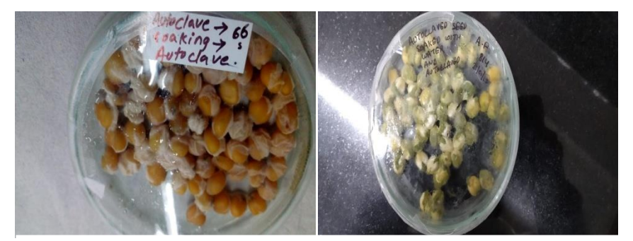
FIGURE 2 Maize seeds