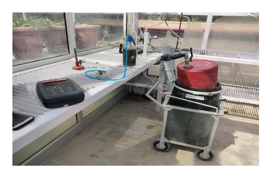
Figure 4.1: In this picture biogas is passed through algae substrate.

Table 4.5 There is no significant change appeared in the gases.